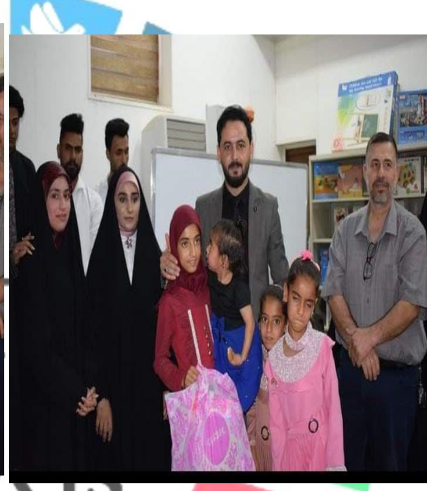
Visit Al Ain Charitable Foundation

The Nour Al-Wafa Cultural Charitable Foundation was visited to distribute school supplies to needy families and orphans. A visit to the Nour Al-Wafa Cultural Charitable Foundation to distribute Eid clothing to needy families and orphans. A field visit to the Karbala Health Department for the purpose of agreeing on obtaining medical aid for our needy students. As well as distributing financial rewards to the institute's members, including teachers, technicians and administrators. Distributing financial aid to some members (social solidarity among members) to support humanitarian and medical cases, and distributing financial aid to needy students (social solidarity among members) or from the formation. And helping students to complete their studies who are exposed to accidents during the school year.