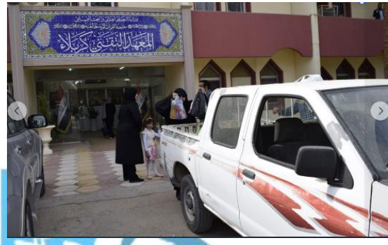
Visit the orphanage

The College of Medical and Health Technologies provided financial assistance for medical and humanitarian cases of its members, amounting to (1,500,000) dinars, based on the principle of solidarity.