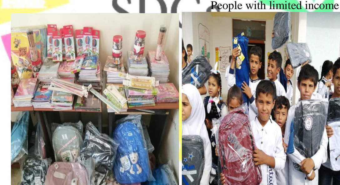
Distribution of stationery to a primary school

The Babylon Technical Institute continues to employ lecturers and contracts with a number of (57) external lecturers and a number of (2) contracts in various scientific departments, assigning them with study materials to participate in reducing unemployment and providing a work permit for the people of the community. As for the Samawa Technical Institute, the Institute distributed clothes and stationery in a number of villages and districts in the governorate.